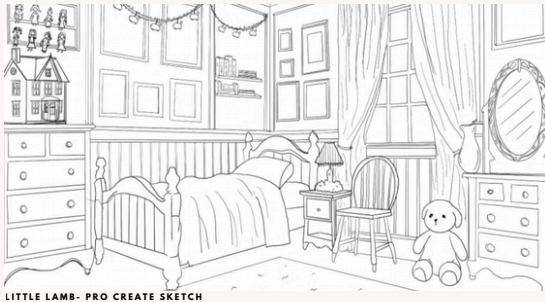
LITTLE LAMB- PRO CREATE SKETCH