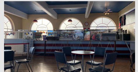
MORE THAN JUST A DREAM MUSIC VIDEO