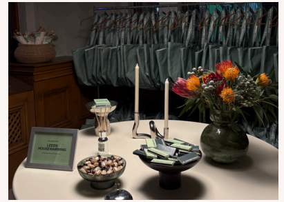
BLANK STREET LEEDS OPENING EVENT