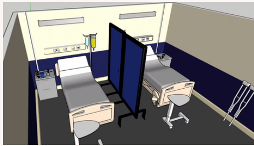
ITS A PART OF LIFE- 3D SKETCHUP DESIGN