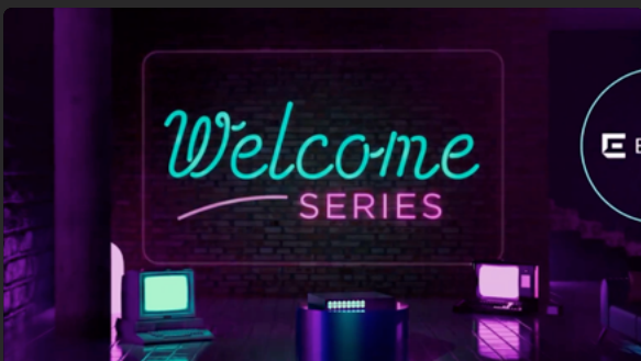
Meet Network Security Basics – Episode 1