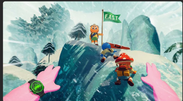
Start Playing: PEAK