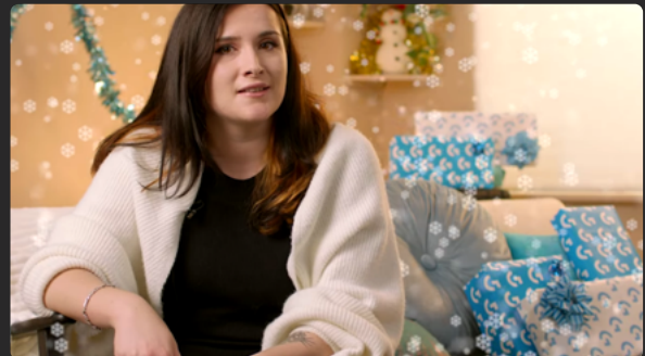
Ultimate Gaming Gifting Guide | Best gaming mice for 2026