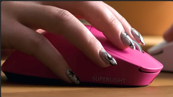
PRO X Superlight 2c, 2 and DEX Grip & Size Breakdown