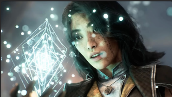
The Big Winners of the Game Awards 2025