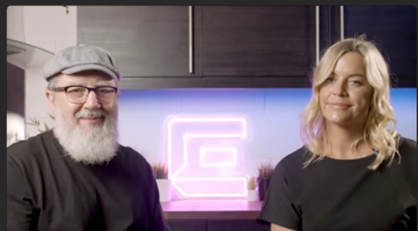
Meet Extreme Control – Episode 1