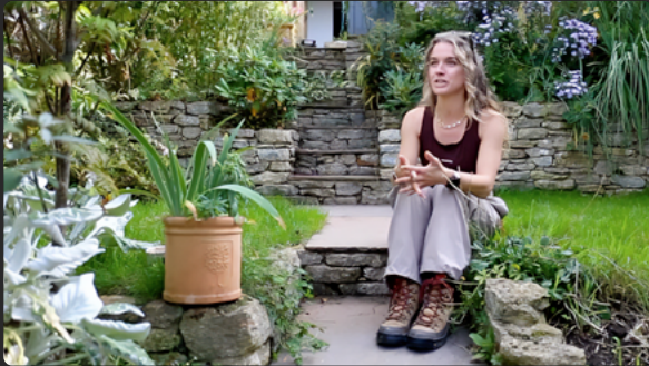
Back to Bristol – Polinator Pathways