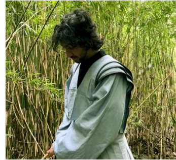
Designing and making a for the script The Winds of Satori . For Kyoshi an ex-samurai, set in a futuristic vision of Japan.