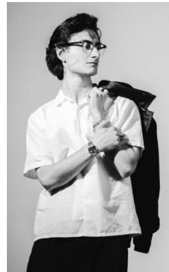
Styling Timothée Chalamet in different contexts. A monochromatic Red Carpet look featuring an embellished harness, and an editorial look inspired by 1950s New York to promote his film 'Marty Supreme'