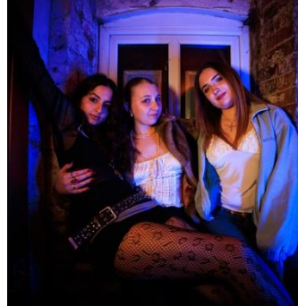
Where's Molly? Short Film