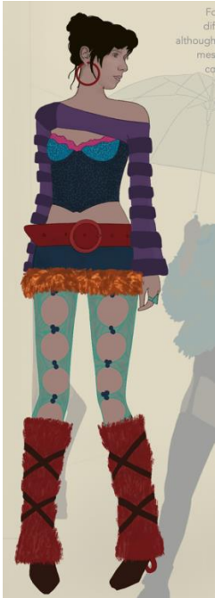
Blade Runner 2049