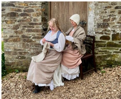
Kemer Ow Ro Short Film