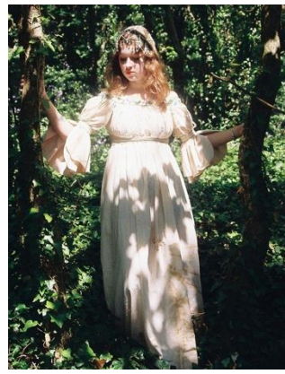
Costume design and character creation of 'The Tarnished Damsel'. Collaborating with a costume maker and actress to create a costume for a performance.