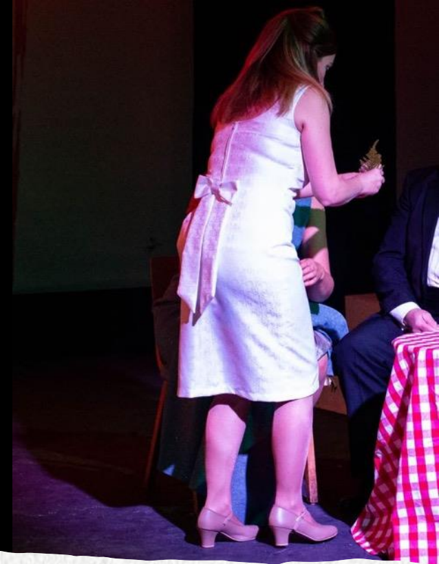
Rickmansworth Players Merrily We Roll Along