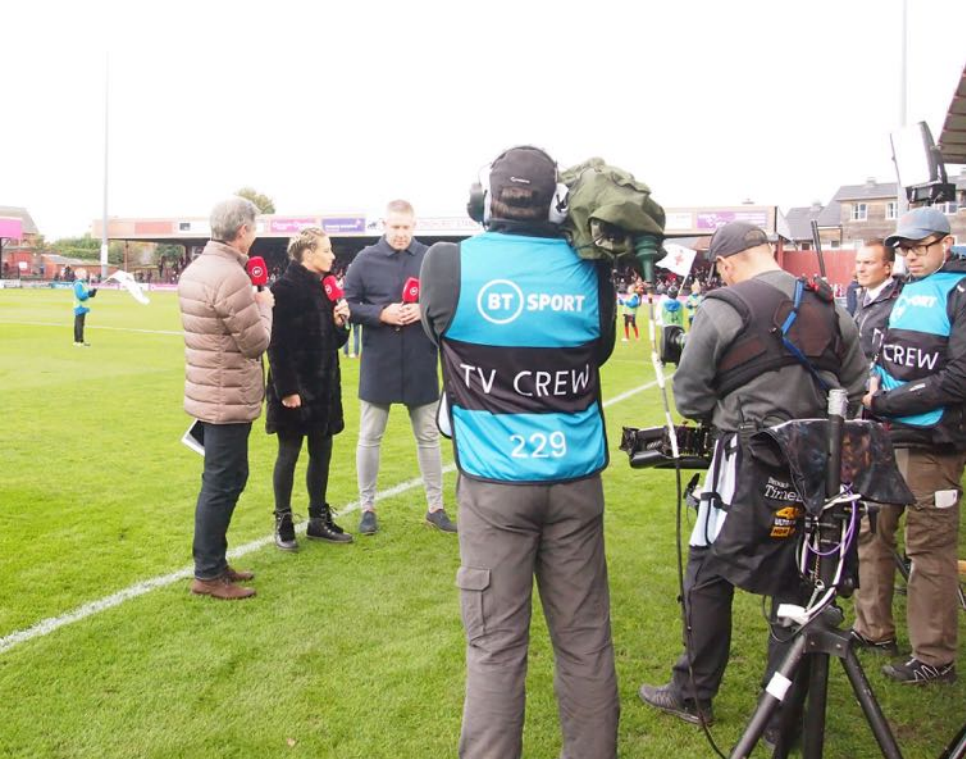
FA Cup: Sound Assistant