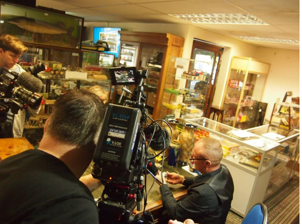
Discovery Channel Pilot: Location Sound Recordist