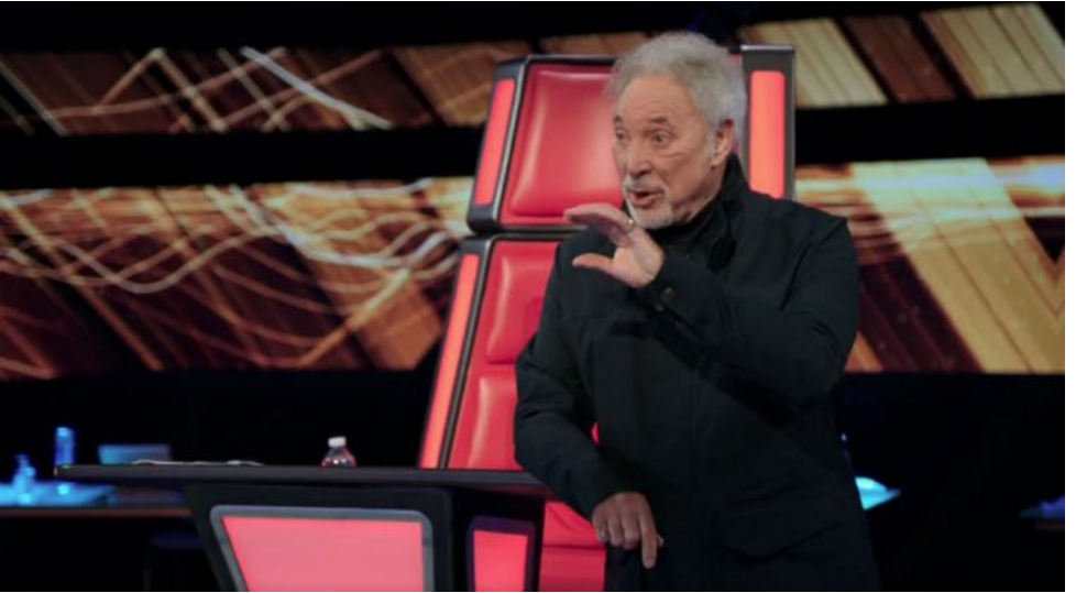
..... The Voice: Sound Recordist, Boom Operator