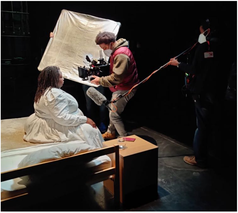
..... Salt: Location Sound Recordist & Boom Op