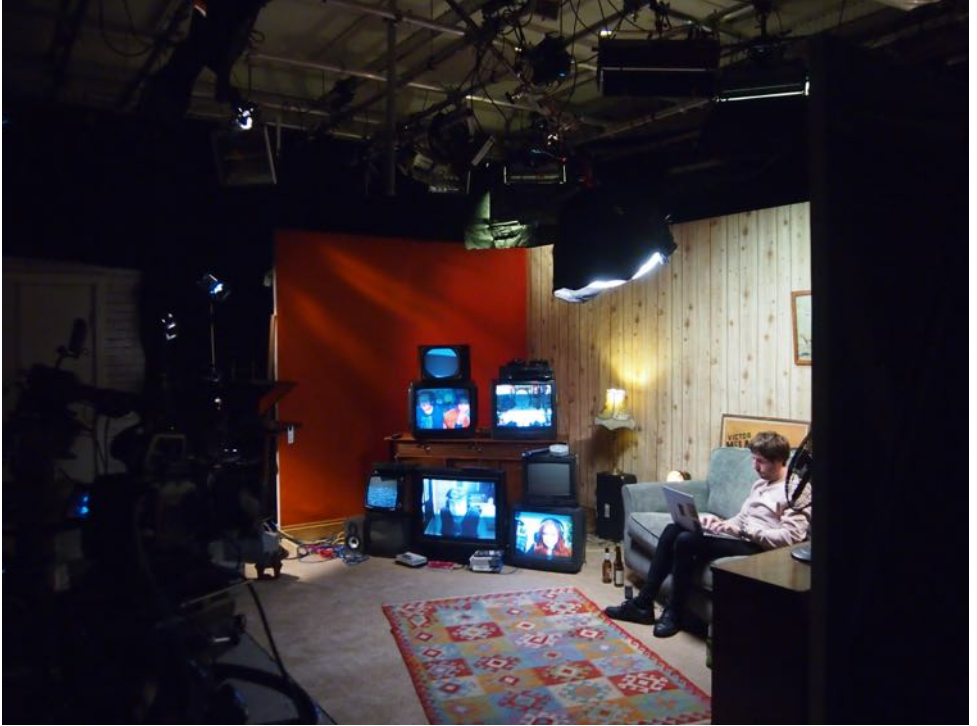
Sound Supervisor: "The Boys" Watch Party