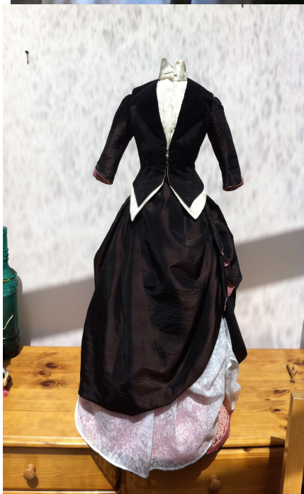
Illustration 6: late Victorian dress