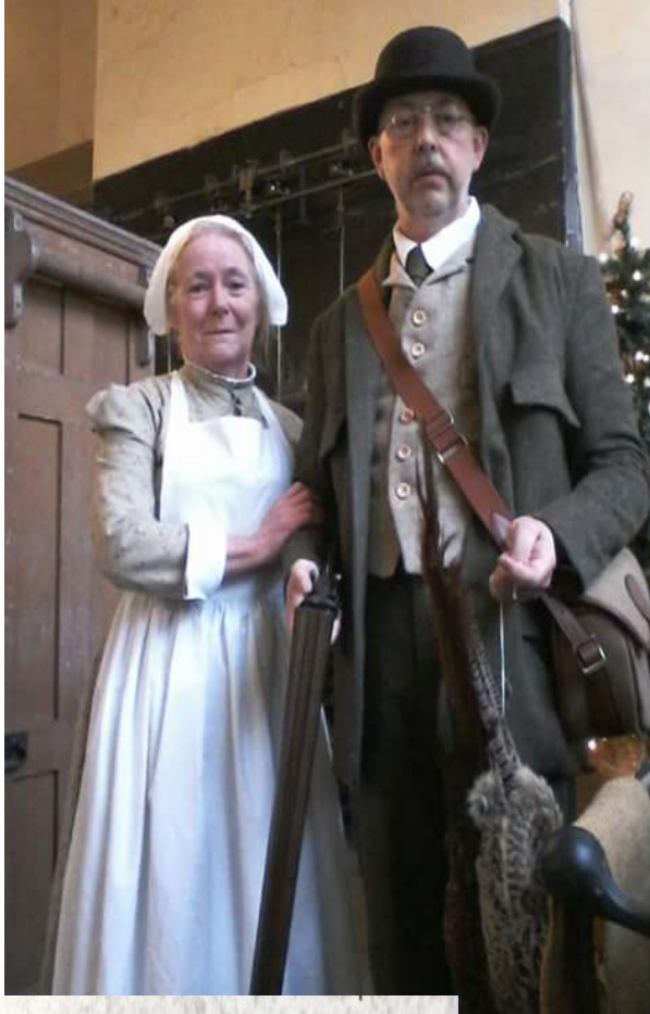
Illustration 4: Mrs P and the gamekeeper - living history museum