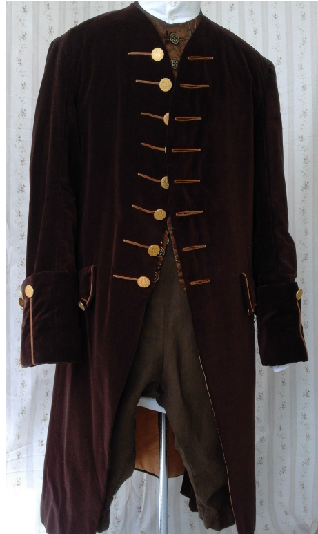
Illustration 2: Mans' C18 outfit