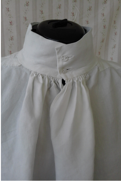
Illustration 1: Man's C18 shirt - handsewn