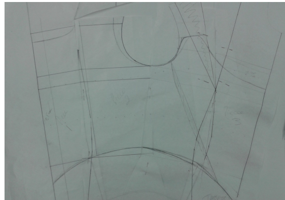
Drafting a corset pattern