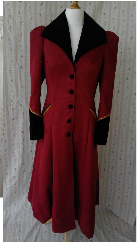
Illustration 3: suedette gothic steampunk coat