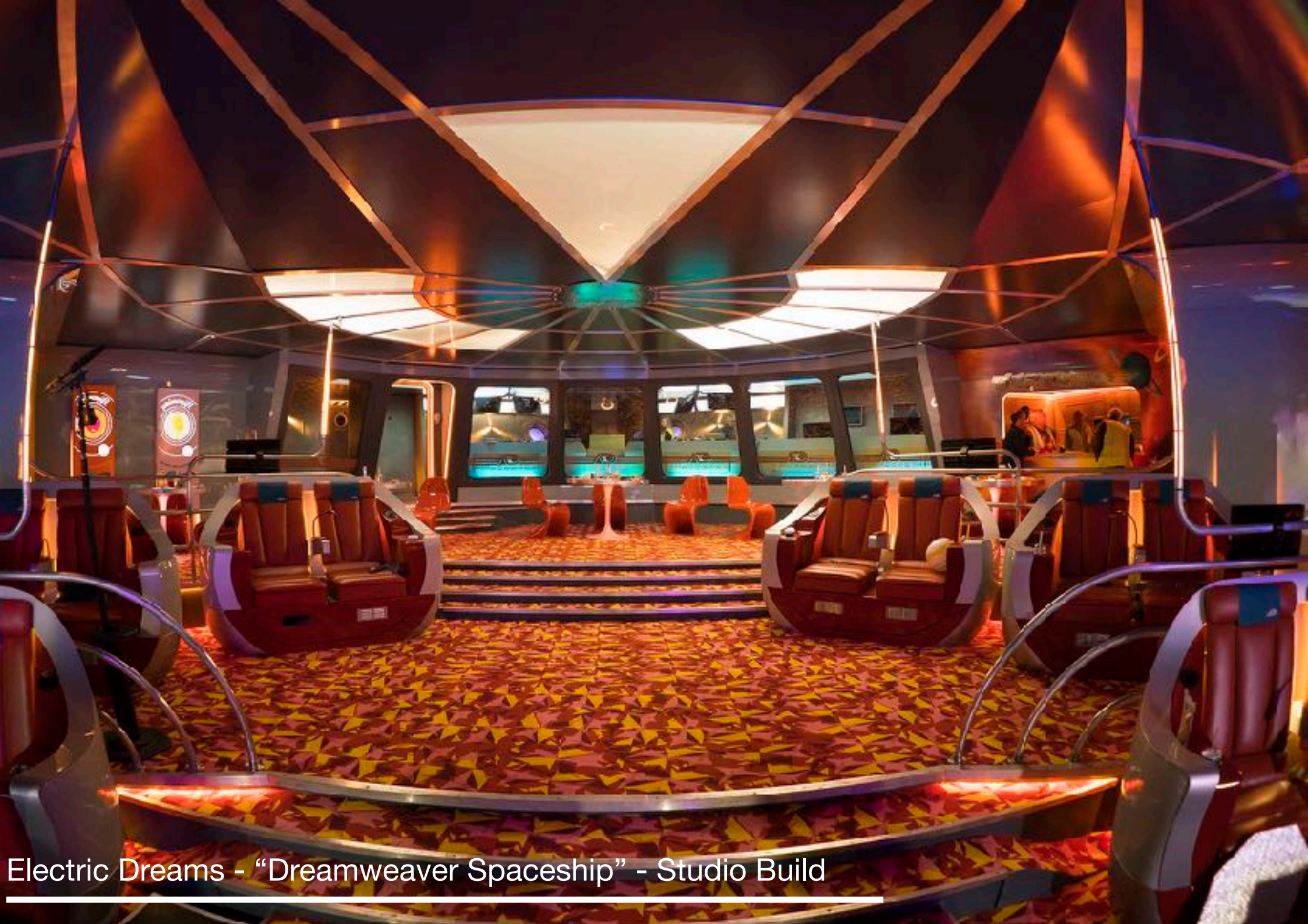
Electric Dreams - "Dreamweaver Spaceship" - Studio Build