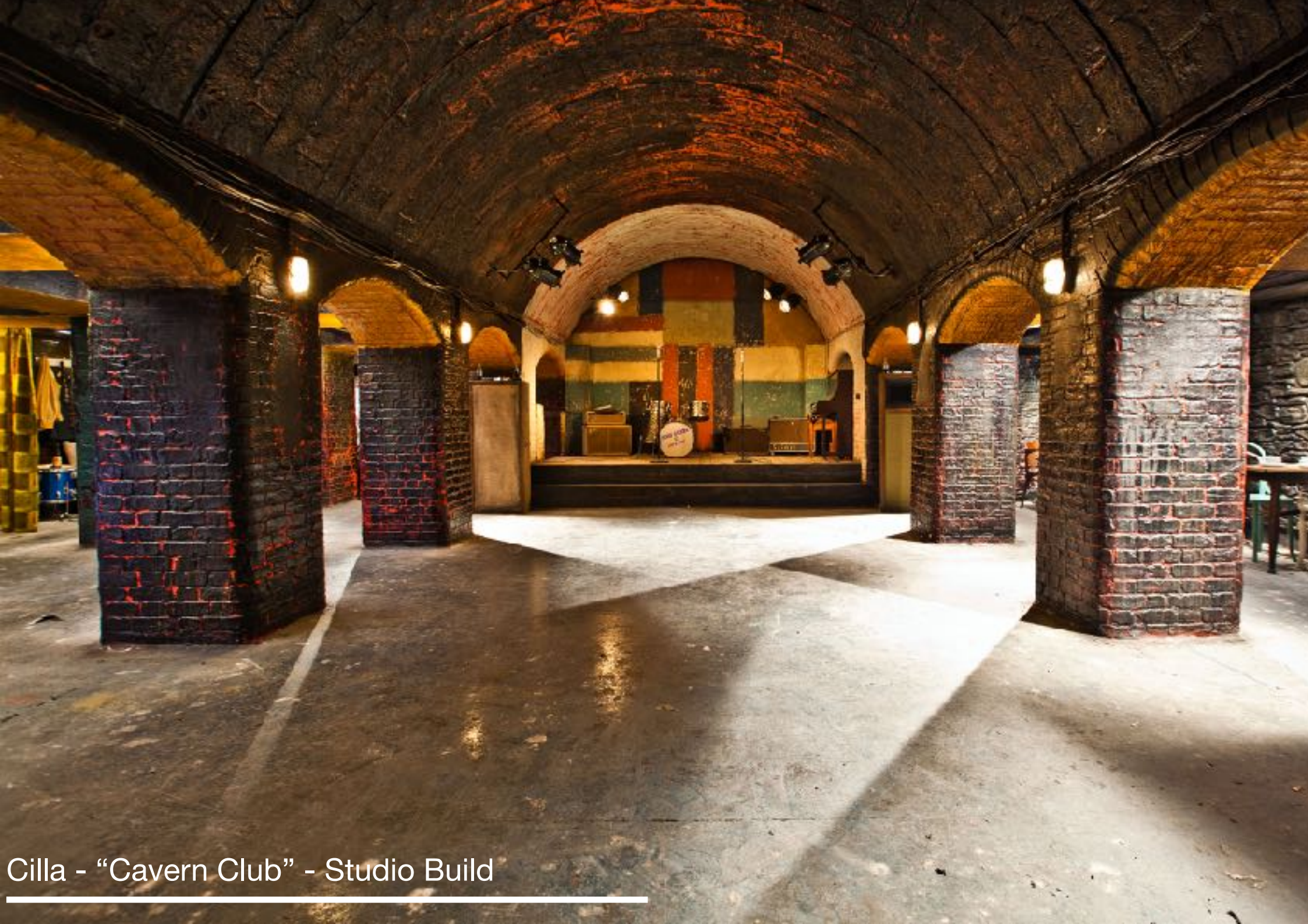
Cilla - "Cavern Club" - Studio Build