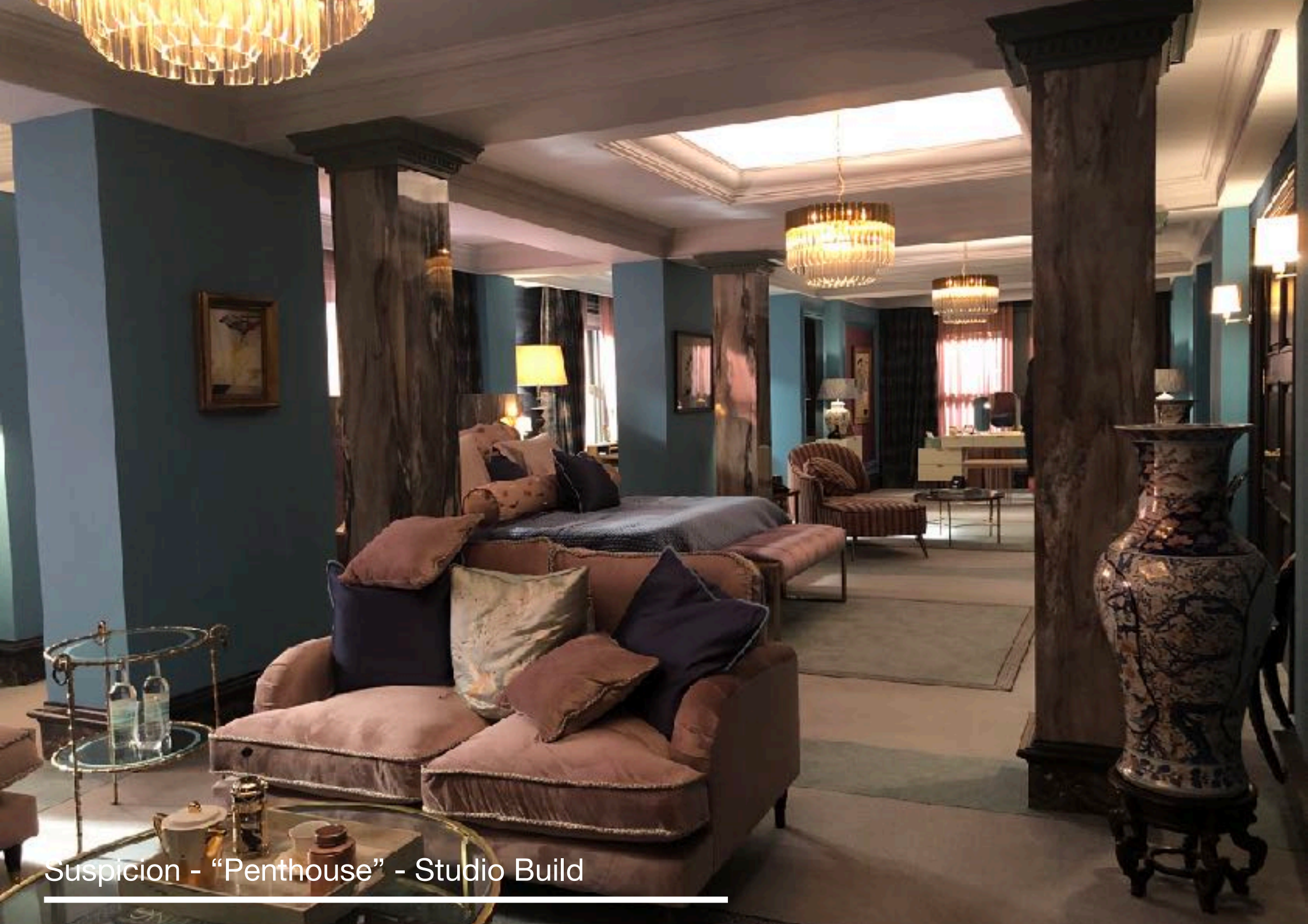
Suspicion - "Penthouse" - Studio Build