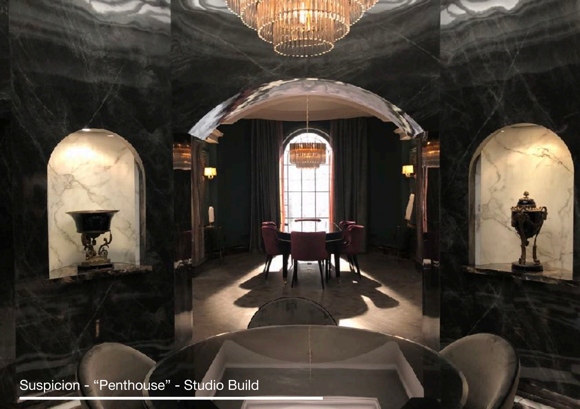
Suspicion - "Penthouse" - Studio Build